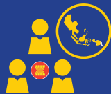
ASEAN Sectoral Bodies & Officials