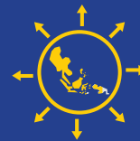
Regional Institutions & Communities