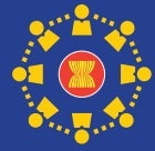
The Wider ASEAN Community

ARISE Plus builds on the achievements of the previous EU funded projects and reaffirms the EU's commitment to support ASEAN economic integration and development.