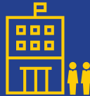
Private sector in ASEAN